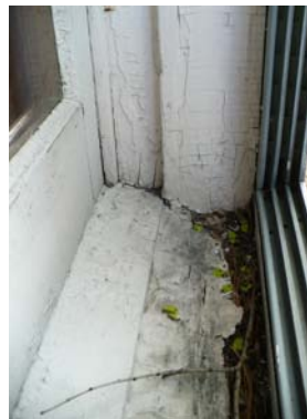
Deterioration at window sill