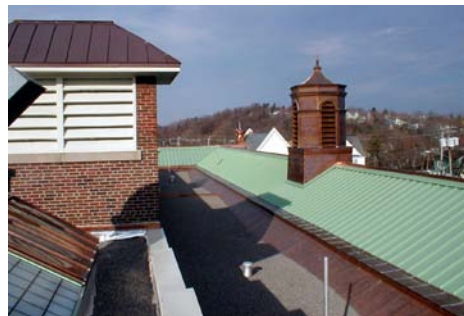
New standing seam copper, pre-finished aluminum & flat roofs