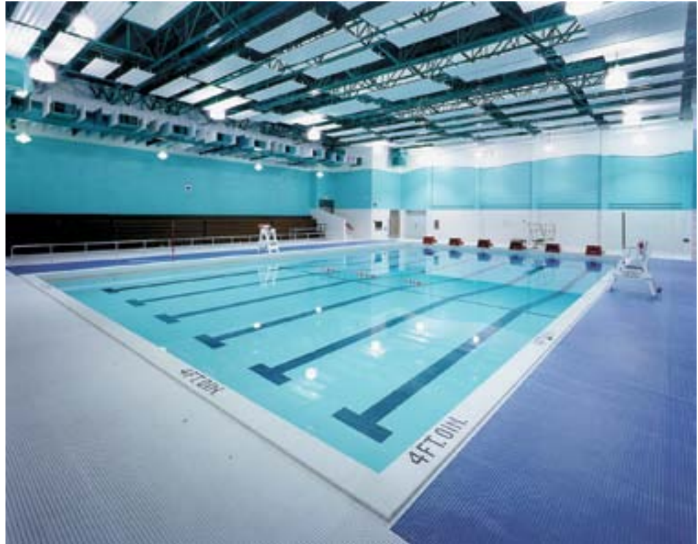
New lighting was designed for maximum visibility into the water, creating a safer environment for students

On January 8, 1998 a 45-foot long section of plaster skylight well, along with sections of the ceiling tile, unexpectedly collapsed into the pool. Bell & Spina was called to investigate.