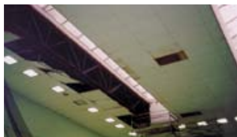
Missing portions of ceiling before construction

Bell & Spina worked around the constraints of the project to produce a low maintenance, state-of-the-art facility.