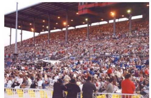
Grandstand during concert

Bell & Spina's work has enabled the Fair's increase in attendance over the years. We take pride when hearing that "The Fair has never looked better!"