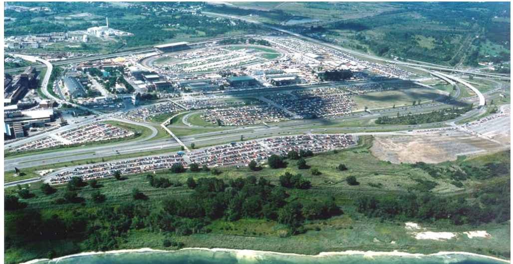
Aerial of fairgrounds

The New York State Fair is one of the largest in the nation and attracts over 1 million visitors in 12 days. The planning for an ever-changing venue is a year long process. For over 25 years, Bell & Spina provided their services as the Fair planners.