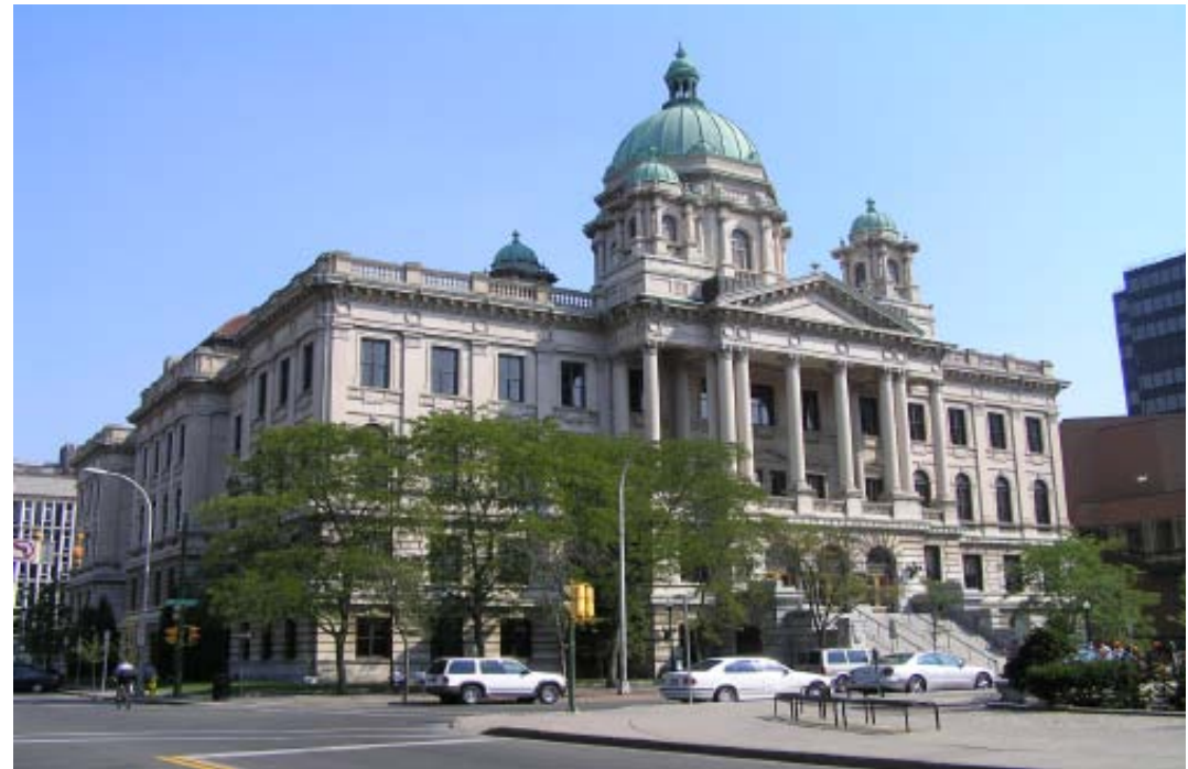
Onondaga County Courthouse

info@bellandspina.com www.bellandspina.com