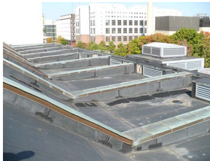
A roof view