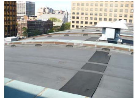
Roof view looking north

Originally constructed between 1949 and 1950, the Onondaga County War Memorial is listed on the National Register of Historic Places as the first thin-shelled concrete roof structure built in the country.