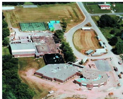
Site under construction

The Master Plan required maintaining school operations within existing buildings while new construction was underway.