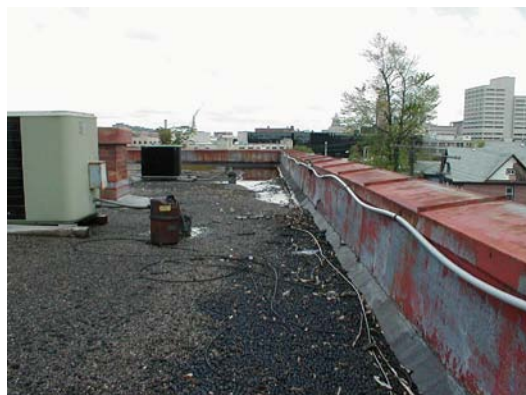
On-Site Roof Inspection

The Building Condition Survey provides the Syracuse City School District with a tool to develop their Maintenance Program and their Five Year Capital Improvement Plan.